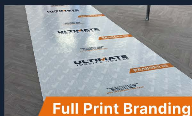
Full Print Branding