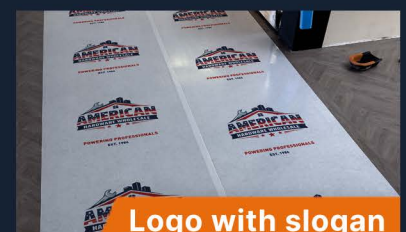
Logo with slogan